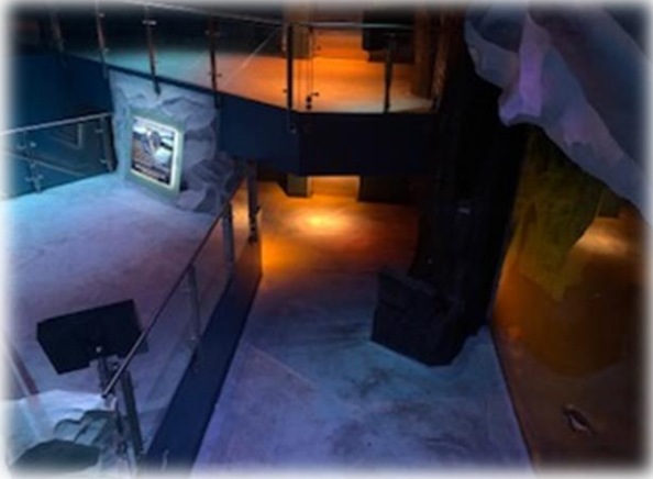
This venue is kept at cooler temperatures. When sleeping here, layers are recommended.