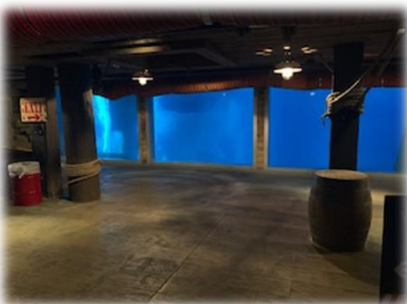
This venue is kept at cooler temperatures. When sleeping here, layers are recommended.